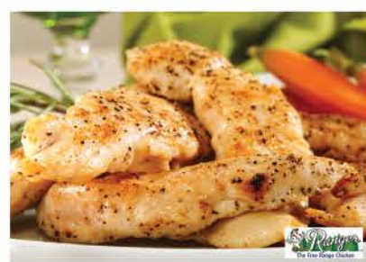
Free Range Boneless, Skinless Chicken Breast Tenderloins Northwest Grown