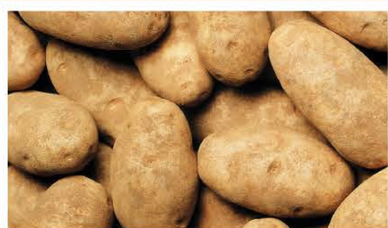
Russet Baking Potatoes