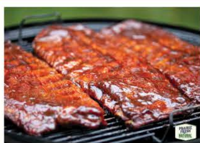
Bone-In St. Louis Style Pork Spareribs