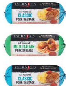
Isernio's Sausage Rolls Selected Vtys., 16-oz.