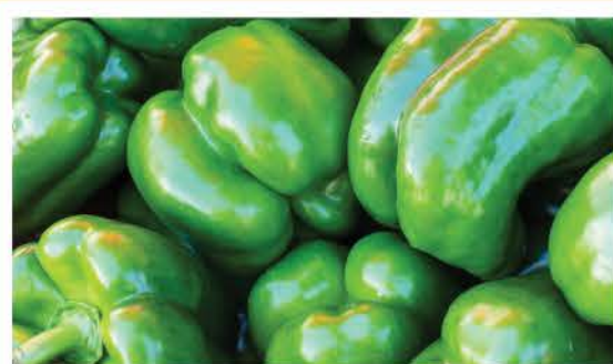
Large Green Bell Peppers