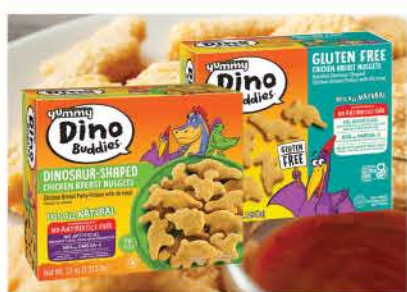
Yummy Dino Buddies Chicken Nuggets Selected Vtys., 18 to 21.5-oz., Frozen