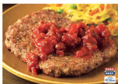
Boneless Beef Cube Steak USDA Choice