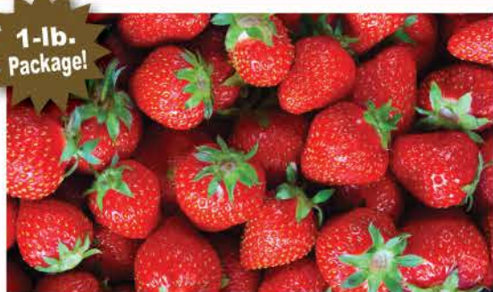
Red, Ripe Strawberries 1-lb. Package