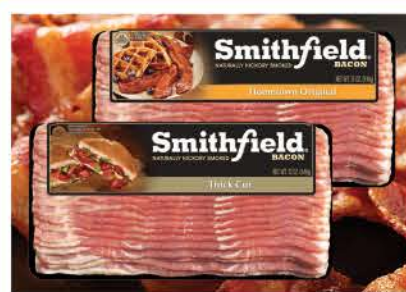
Smithfield Bacon Selected Vtys., 12-oz.