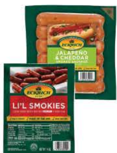
Eckrich Smoked Sausage or Li'l Smokies Selected Vtys., 12 to 14-oz.