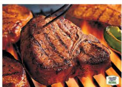
Bone-In Center Cut Pork Loin Chops