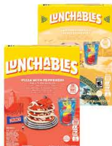
Oscar Mayer Lunchables Selected Vtys., 8.9 to 10.7-oz.