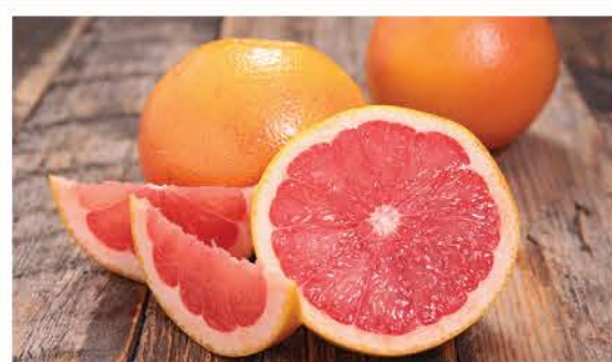
Sweet California Red Grapefruit