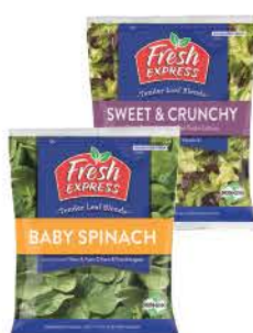
Fresh Express Tender Leaf Blends Selected Vtys., 5-oz.