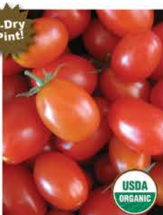
Organic Grape Tomatoes Dry Pint