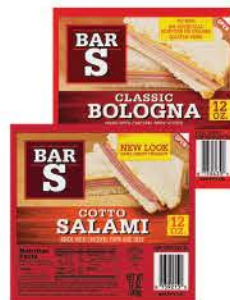
Bar-S Salami or Bologna Lunchmeat Selected Vtys., 12-oz.