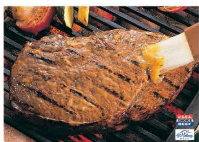
Boneless Beef Top Sirloin Steak USDA Choice