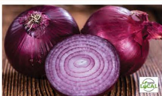
Jumbo Red Onions