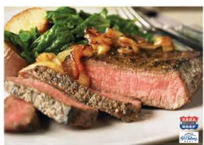
Boneless Beef Bottom Round Steak USDA Choice