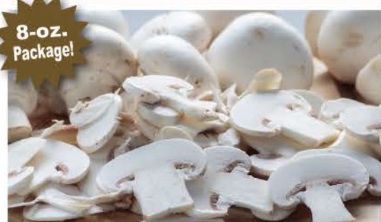
Whole or Sliced Mushrooms 8-oz. Package