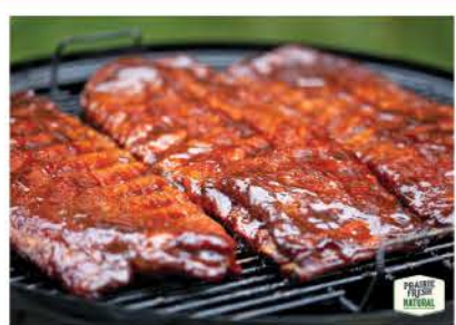
Bone-In St. Louis Style Pork Spareribs