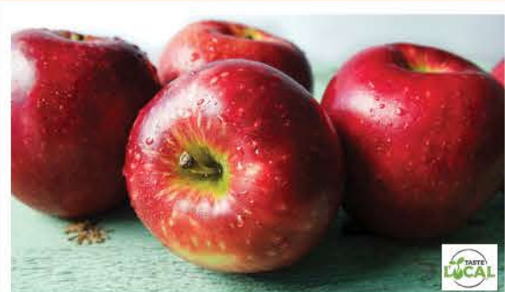
Cosmic Crisp Apples Northwest Grown Washington Extra Fancy