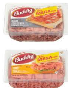
Buddig Mega Pack Lunchmeat Selected Vtys., 22-oz.