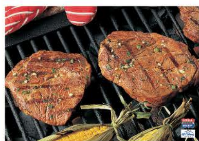
Boneless Beef Chuck Steak USDA Choice