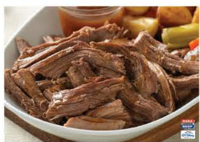
Boneless Beef Chuck Roast USDA Choice