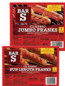
Bar-S Classic Franks Jumbo or Bun Length 1-lb.