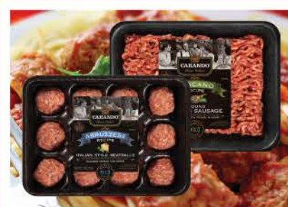
Carando Meatballs or Ground Italian Sausage Selected Vtys., 16-oz., Frozen