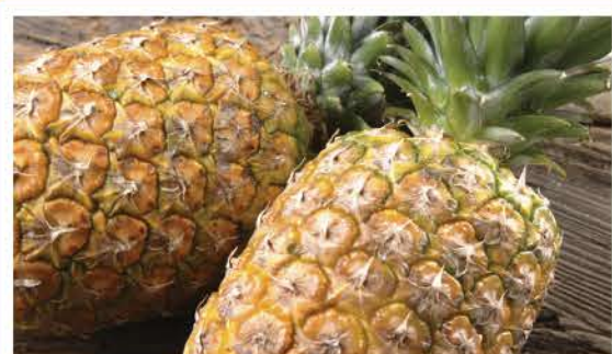
Golden Ripe Pineapple