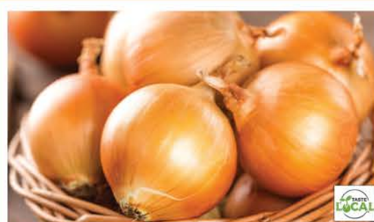
Jumbo Yellow Onions