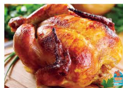
Draper Valley Farms Whole Chicken Northwest Grown