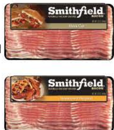
Smithfield Bacon Hometown Original or Thick Cut 12-oz.