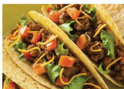
Ground Beef 85% Lean Made Fresh In Store