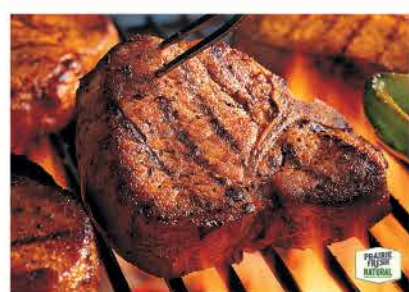
Bone-In Center Cut Pork Loin Chops