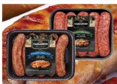
Carando Italian Sausage Selected Vtys., 19-oz., Frozen