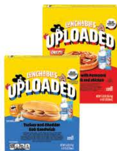
Oscar Mayer Uploaded Lunchables Selected Vtys., 13.9 to 15.1-oz.