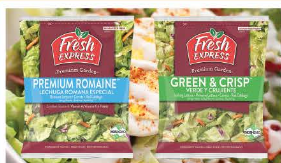
Fresh Express Premium Garden Salad Selected Vtys., 9 to 11-oz.