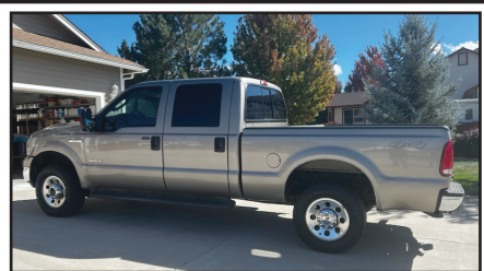
2005 F250 Diesel Minden

Ford F250 Diesel Super Duty excellent condition, 161k, Brand New Turbo Charger, original owner