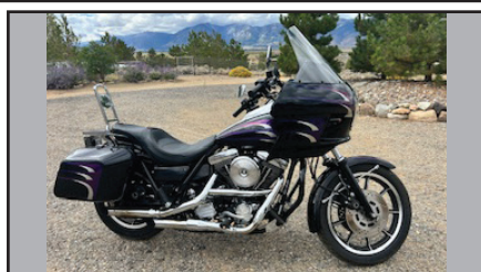
1991 Harley Davidson FXRT Minden

25,660 miles, lots of extras, for more information Call