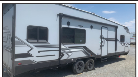
2022 Stealth TRQ2715G Toy hauler Carson City

weighs 8100 lbs. Dry with a GVWR of 11400. It is 33 feet long. If interested, please Call.