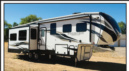
2021 Heartland Bighorn Traveler 32RS Minden

36' 5th wheel 11k lbs dry, hydraulic auto-leveling, 15k BTU A/C, 35k BTU furnace, 65 gal fresh, 90 gal gray, 45 gal black tanks