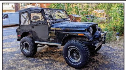
1980 Jeep CJ 4X4 Fallon

New Soft Top, New Clutch New alternator, 6 Cylinder Warn Winch, kept in garage Runs good! Great Project: Extra Parts