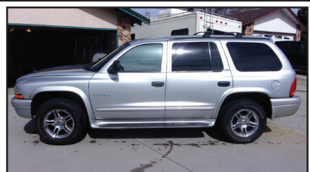
2002 Dodge Durango R/T Carson City

5.9-liter V-8, Auto Trans, AWD Front & Rear Air cond. In storage many years. 138k miles.