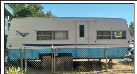
1977 Coachman Cadet Carson City

Older travel trailer - 22 ft Coachman Cadet - for sale. Some work done, mostly need to check systems. Illness forces sale. For more information.