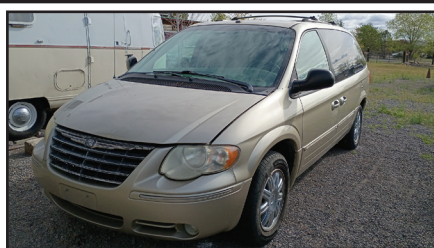
2007 Chrysler Town & Country Dayton

Runs excellent, new battery, new windshield, new rear tires, 167k miles, needs alternator.