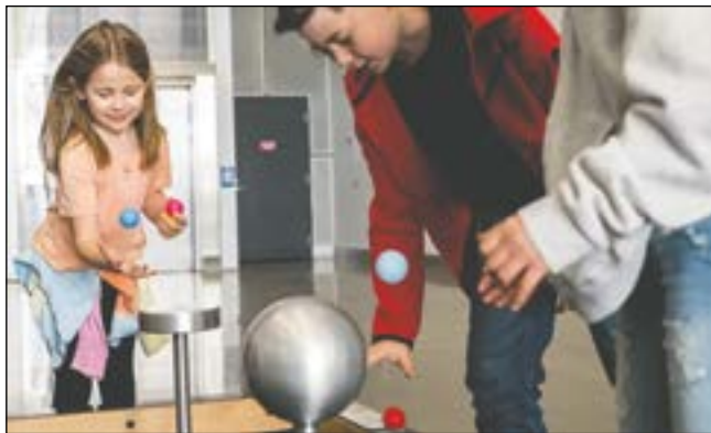
Kids play at the Bernoulli Table at the Boeing Future of Flight Kids Zone.