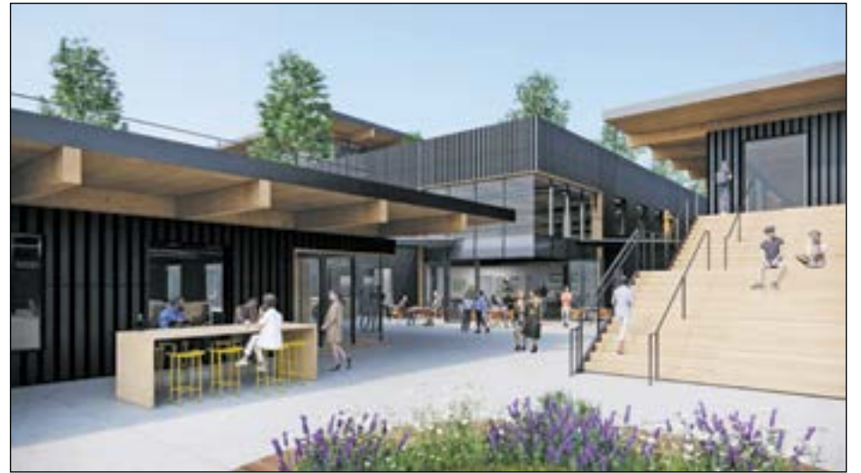
Millwright District Office Park rendering

The Port of Everett's Waterfront Place is a new 1.5-million square foot mixed-use development located on 65 acres at the waterfront near the downtown core in Everett, Washington. The development boasts spectacular views, waterfront access, recreational amenities, and a world-class marina – the largest public Marina on the West Coast – with 2,300 slips and 5,000 linear feet of