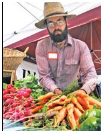
Wetmore. See you there!

The Market offers ample street parking with ADA spaces close by. The address is 2930