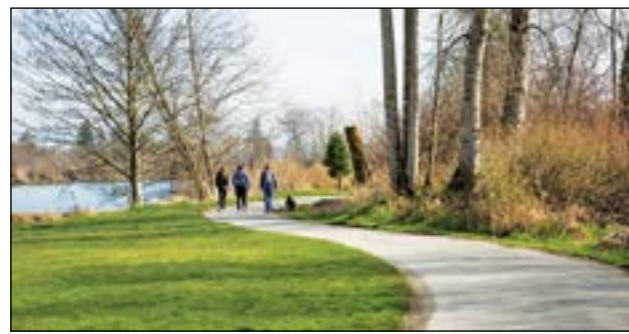
Rotary Park offers access to the Snohomish river system for small river boats.

Whether you prefer saltwater, the brackish water of an estuary, a meandering river or a deep lake, Everett Parks has beaches, views and boat launches to get you closer to the water. There are also many parks to visit with your children for a great family outing. For more information on any of the parks that Everett Parks and Recreation offers, call 425-257-8300. A complete list of parks can be found at www.everettwa.gov