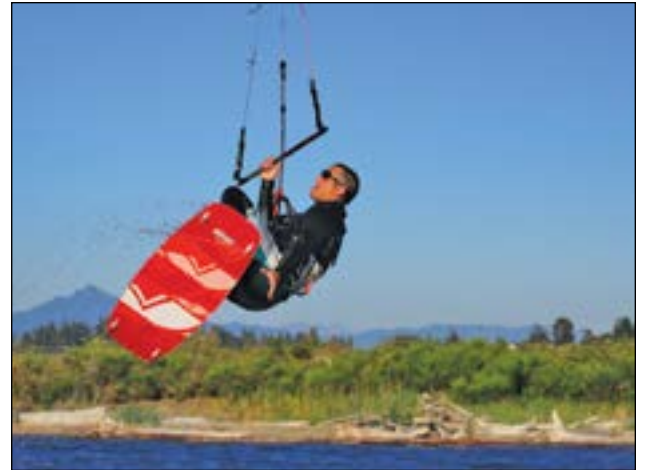
Kiteboarding at Jetty Island

The crosswalk at Alverson Blvd. and W. Marine View