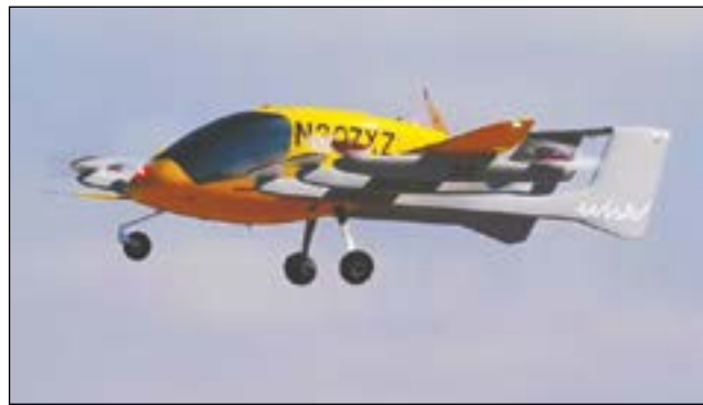
Gen 5 of the Wisk Aero in flight.

Imagine Children's Museum Spend the day at Imagine Children's Museum, Washington's ultimate play and learning destination where curiosity meets discovery!