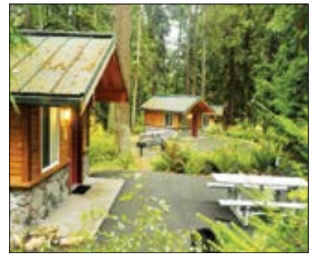
Cabins are available for rent at Flowing Lake County Park.