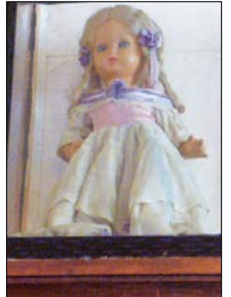
The creepy doll at the Oxford Saloon and Eatery in Snohomish.

found that his predecessor had been buried with indigent status and no grave marker. In 2002 he rectified that wrong, forever memorializing her as a "Cherished Snohomish Librarian" on a marker at Seattle's Evergreen-Washelli Cemetery.