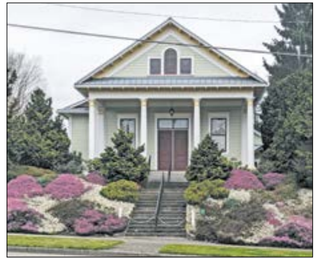
Tim Noah Thumbnail Theater is located at 1211 Fourth Street in Snohomish.

The Thumb also hosts a weekly Friday Night Open Mic, a bi-monthly Ukulele Community of Joy, Summer Musical Theater Camp, and is available for rental for performance recitals,