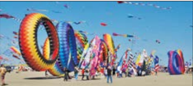
See famous kite flyers from around the world.

The Washington State International Kite Festival will be Aug. 18-24 at Long Beach. The Festival boasts skies ablaze with color, high flying action and choreographed movement. The event draws famous kite flyers from all over the world and tens of thousands awed spectators, many of which participate in the fun with their own