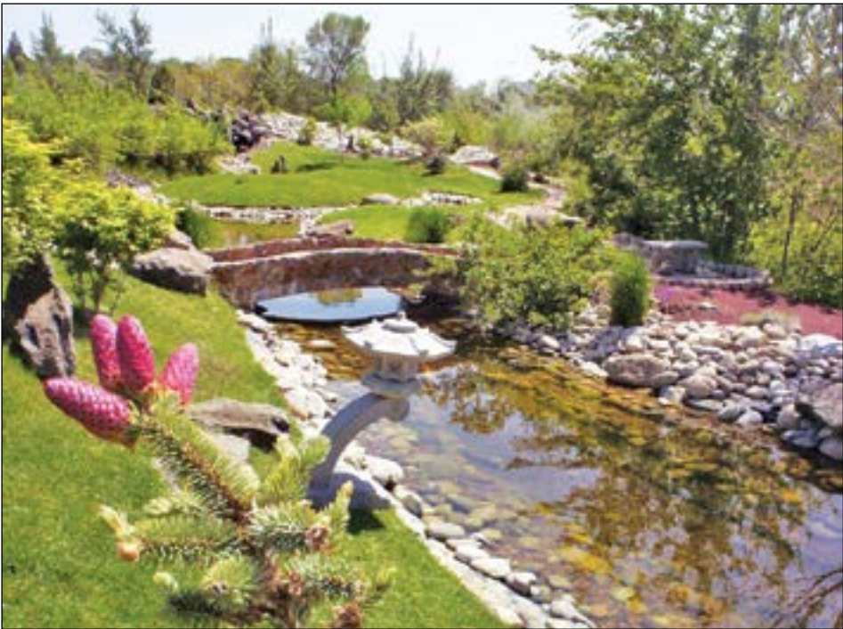
Autumn at the Japanese Peace Garden