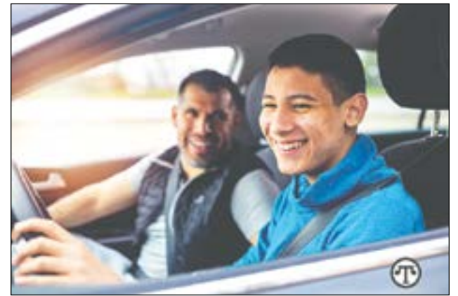
For teen drivers, ensuring vehicles are recall-free adds an extra layer of protection as they travel to and from school, extracurricular activities, and social gatherings.

Recall repairs can take as little as one hour, and many dealers offer options such as ride share vouchers,