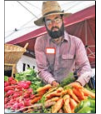
ADA spaces close by. The address is 2930 Wetmore. See you there!

You will find winter produce, value-added artisanal goods, a variety of eclectic artists, and delicious hot food on this first of twenty-nine Sundays in 2024! Come and enjoy a Sunday afternoon 10:30 to 3:00 p.m. in the Heart of Downtown where Teh Market plans to "Cultivate Community" on Wetmore between Hewitt and Pacific Avenues. The Market offers ample street parking with