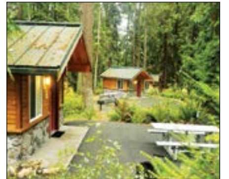
Cabins are available for rent at Flowing Lake County Park.