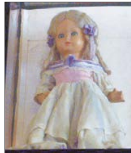
The creepy doll at the Oxford Saloon and Eatery in Snohomish.

Spirits linger around every corner of the Historic District downtown.