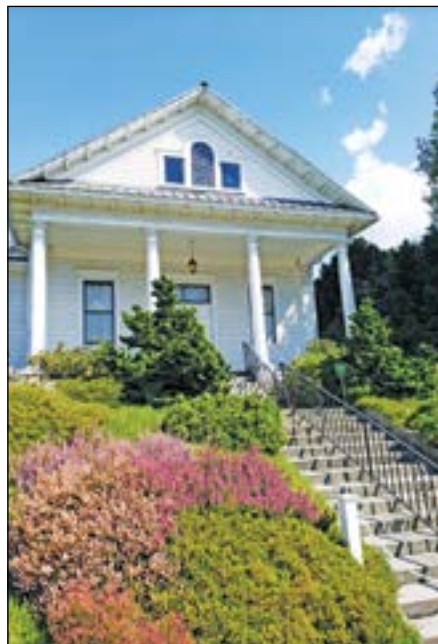
Tim Noah Thumbnail Theater is located at 1211 Fourth Street in Snohomish.

Visit www.thumbnailtheater.org for events and other information.