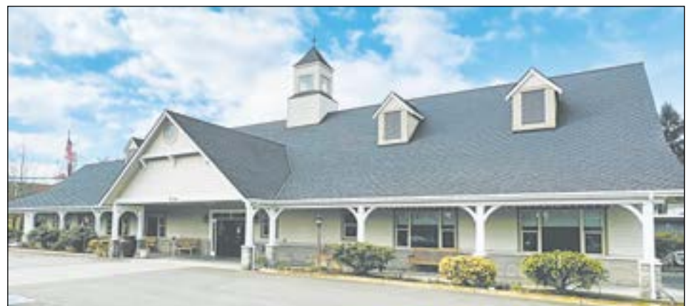
The Snohomish Senior Center is a great gathering place for senior citizens as well as a nice venue for weddings, birthdays, anniversaries, and gatherings of most any kind.

The Snohomish Senior Center is a lovely 6,000 square foot building and more than 1,330 seniors enjoy the center.