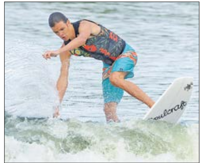
The Nautique WWA Wakeboard & Wakesurf National Championships will be July 25-28 at Lake Tye.

July 31-Aug. 4: C-Fair Charity Horse Show, Evergreen State Fair Park