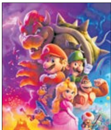
Super Mario Bros shows Aug. 2

They are on a quest to find Mario's brother, Luigi, and to save the