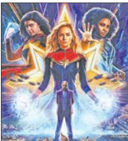
The Marvels will show August 16

When Floyd is kidnapped, Branch and Poppy embark on a