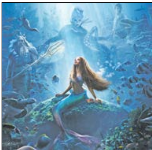
The Little Mermaid will show August 30

Barbie and Ken are having the time of their lives in the colorful and seemingly perfect world of Barbie Land. However, when they get a chance to go to the real world, they soon discover the joys and perils of living among humans. — IMDb