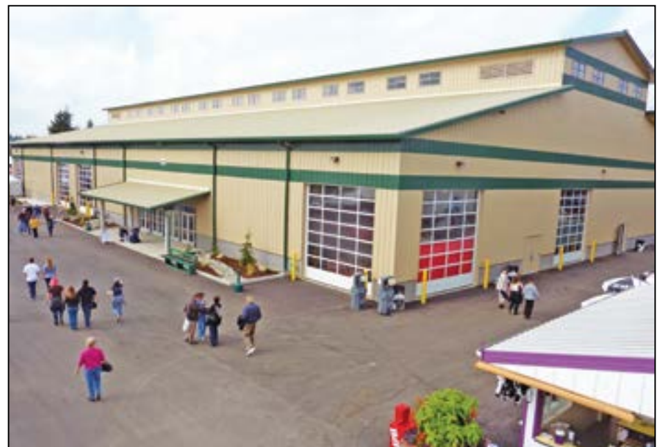
The Gary D. Heikel Event Center is a 33,000 square foot building with attached restrooms.

The fun at the Evergreen State Park isn't confined to just the Fair (Aug. 22-27 and Aug. 29-Sept. 2). No, the grounds are used all year round. There are animal shows, both domestic and farm; swap meets, collectibles and special interest shows such as quilt shows, woodcarving shows, hobby shows and craft markets, as well as the popular auto racing at the Evergreen Speedway.