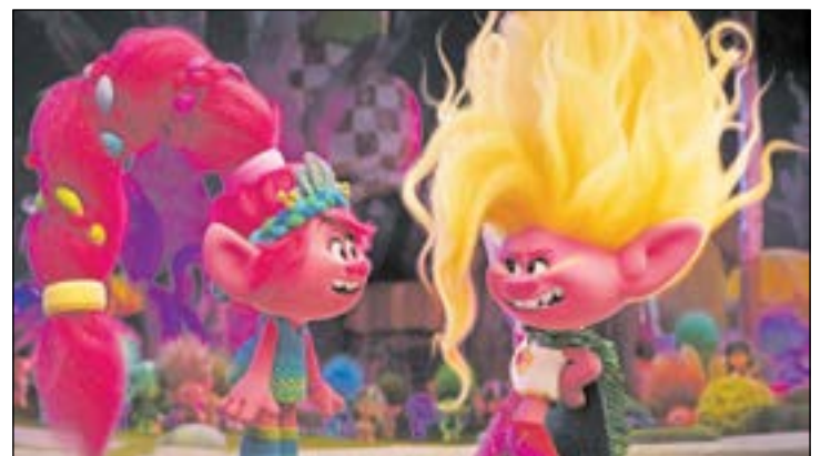
Trolls Band Together will show August 9