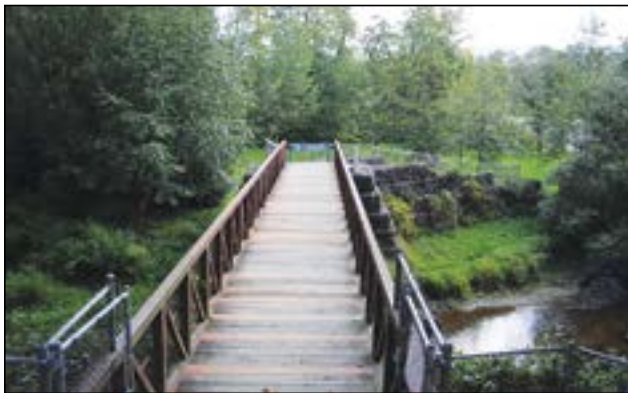
Al Borlin Park park is accessible by this footbridge from Lewis Street Park or by vehicle via Simons Road.

The new playground at Currie View Park will include a taller climbing structure with a rope swing for older kids and a low-height climbing dome, a small merry-go-round and a small play fort for young kids, plus swings and slides. Installation of the new playground could start by August.