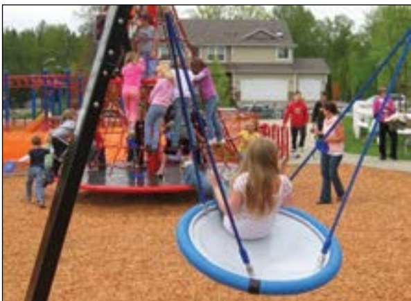
Rainier View Park playground.