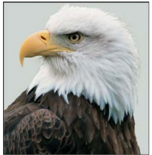
The Stillaguamish Watershed is one of the largest populations of wintering Bald Eagles in the lower 48 states. Other watersheds with healthy salmon population such as the Skagit and Nooksak rivers also provide winter Bald Eagle habitat.

The best Eagle watching season is from late November to late-January with Eagle numbers peaking from Christmas through the second week of January. During high flow events or later in winter after salmon carcasses are no longer available, Eagles tend to congregate in the lower watershed and target waterfowl and other birds. Most of the river-related feeding activity is concentrated in the morning. When not actively feeding or searching for food, Eagles will perch in nearby trees to conserve energy. Bald Eagles will also communally roost overnight in the vicinity of a food source. There are 14 known communal winter roosts in the Stillaguamish Watershed.