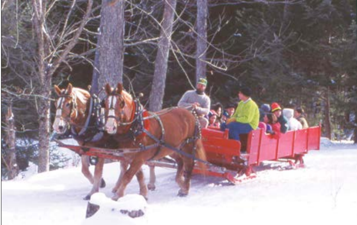
The Leavenworth area attracts many visitors year round. The fall and winter months are popular for Oktoberfest, sleigh rides, snowshoeing, cross country skiing and the famous Tree Lighting Festival.

Lake Wenatchee, Fish Lake and Plain feature activities for the adventure-seeker, strollers along the shores